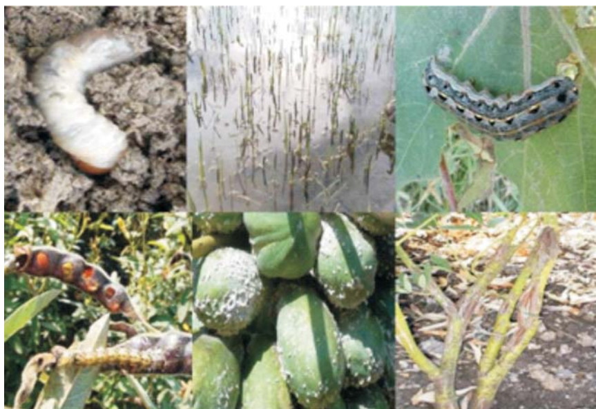
Emerging pest problems of 21st century

IPM is a knowledge-based, farmer driven management approach seeking to maintain pests below economically damaging levels as a major component of ecologically viable and sustainable agriculture. An urgent need for IPM was felt with the consequences of overuse of synthetic pyrethroids on cotton cultivation; culminating into a large-scale epidemic of Helicoverpa armigera during 1987 accompanied by resurgence of whiteflies and in their wake the farmers' suicides. Cotton with only 5% area consumed > 50% pesticides and yet the problem evaded solution. At about this time in 1988, ICAR established NCIPM. After the initial teething troubles, NCIPM took up the challenge of developing IPM approach for rainfed cotton, by first synthesizing and evaluating various IPM modules at small scales (1995-97) and then going in for a holistic, community based village level approach at Ashta in Nanded district of Maharashtra from 1998 onwards. The