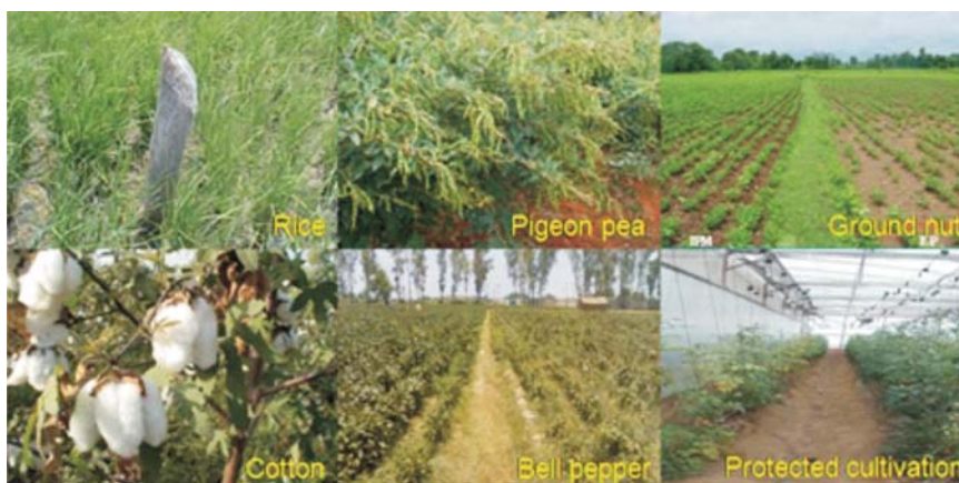
IPM validation in different crops

Each of the crop -commodity - based research institutes evolving IPM strategies and their multi location testing through AICRP centres although brought out relevant technologies for recommendation by the SAUs, the variability of geographical, agro climatic, crop production and protection conditions and lack of unification with policies and input availability always reduced the efficacy of IPM. Validation and popularization of IPM among crops of rice, pulses, sugarcane, oilseeds and vegetables at famers’ fields have been done by NCIPM across different parts of the country and have paid dividends in terms of profit, reduction in pesticide use along with awareness among farmers. The highlight of the centre during the last decade has been the integrated surveillance cum awareness through national information